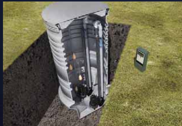
Installation options include submerged installation on auto-coupling with guide rails.