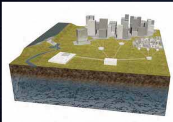
SEG pumps can be used for alternating or continuous operation throughout the water cycle. See examples online.